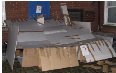
'Steria House' Best Dwelling Prizewinner.